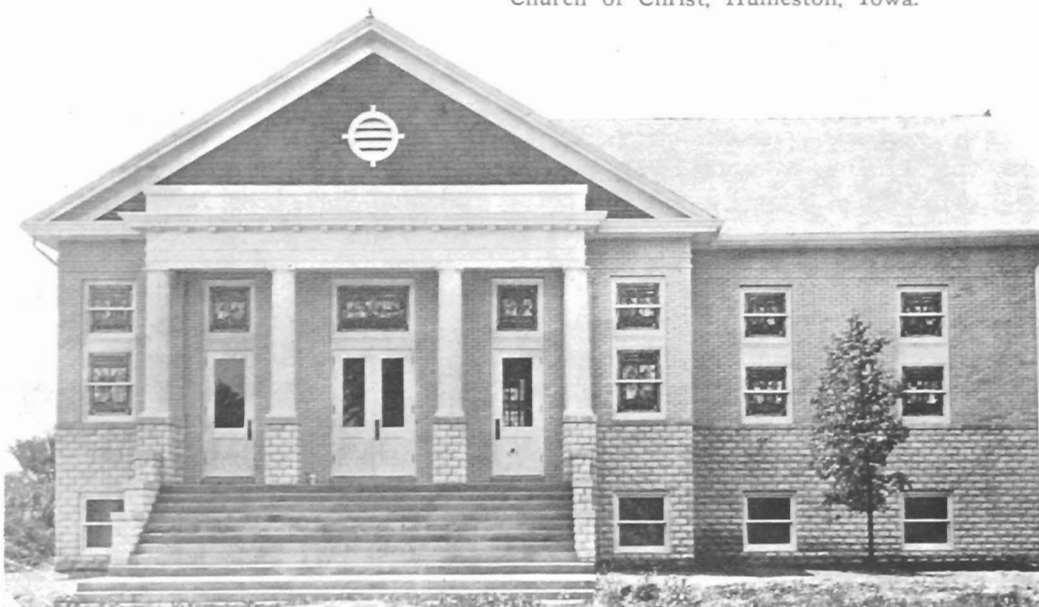
New Church 1910